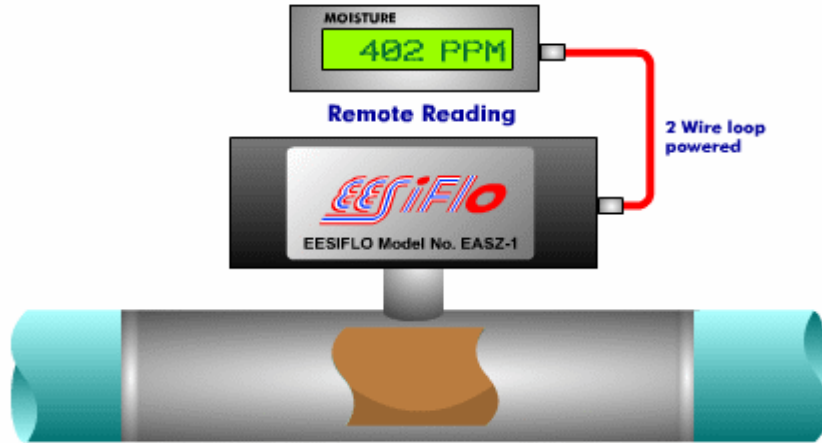
Above is saturated water in oil

The EASZ-1 is able to measure water dissolved in oil down to ppm levels