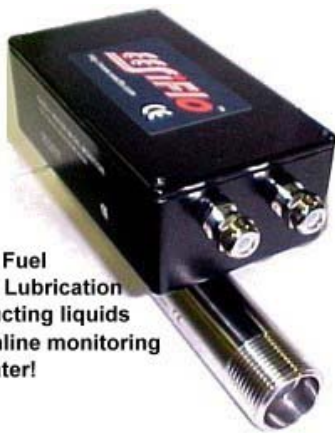
Sensor for Fuel Hydraulics Lubrication Non-conducting liquids Reliable online monitoring of Total water!

Continuous and accurate monitoring of water contamination in any oil including Lubrication Oils, fuels and Hydraulic Oils, Diesel and any Oil based chemical. The EASZ-1 is a unique system which provides Operators of all types of Engines, Pipelines, Turbines, Thrusters, Azipods, Gears, Separators, Filtration systems and Stabilizers with a means of continuous monitoring of the oil systems for possible water contamination